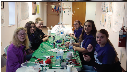
Students included members of the Delta Tau Sigma service sorority, students in the Career Explorations class, and even a stray high school exchange student from Thailand.