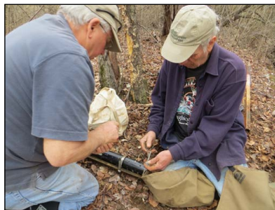
Data Logger Maintenance