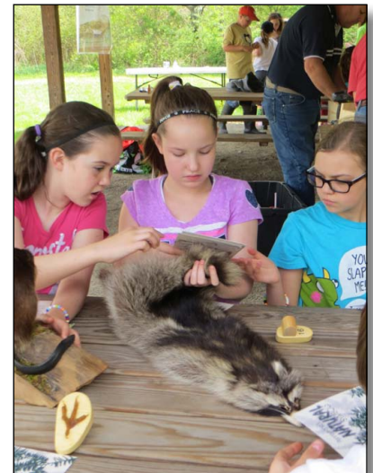
Outdoor Classes in Tanoma