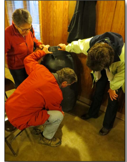
Making Rain Barrels