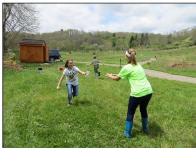
Fun &amp; Educational Activities