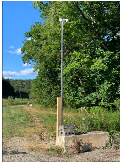
New Motion Activated, Security Pole Light

A motion activated security light has been added to the parking lot. It was deemed necessary due to a few incidents of illegal activity. Of course it's powered by the off-grid solar/wind/hydro electrical system.