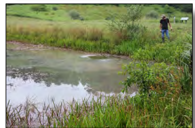
DEP Crew Flushing Underground Pipes