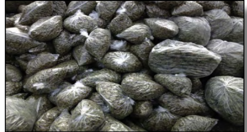
5,500 pounds of plastic that didn't go into a landfill.